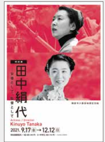
Current Exhibition Actress/Director Kinuyo Tanaka

This exhibition introduces the footsteps of Kinuyo Tanaka, who was closely connected to Kamakura by displaying her precious mementos.